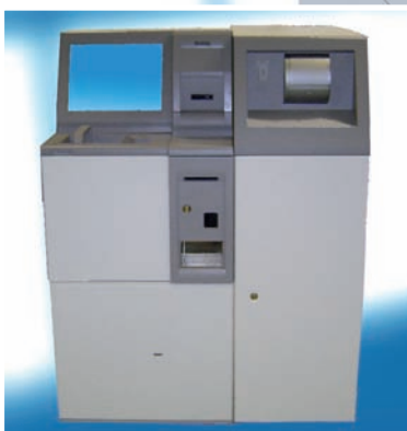
The CDS 830 with note module Lobby 90.