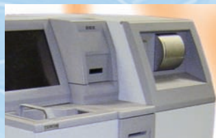
Coins and notes – a total cash deposit service.

CDS 830 has all the latest improvements in SCAN COIN patented electronic sensor technology. Our highly accurate and reliable sensors identify and count deposited coins, while rejecting foreign, damaged and counterfeit coinage. You can select the coin recognition standard you need, with performance levels available to meet even the most demanding requirements.