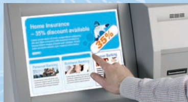
Touch screen layout can be easily changed.