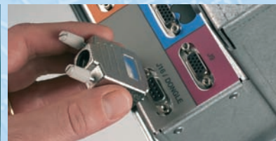
Easy information upgrade through unique detachable dongle, no programming or data lost.

Choosing the bundle note module option turns the CDS 830 into a sophisticated, cost-effective solution for note and coin processing, offering customers a convenient total cash deposit service.